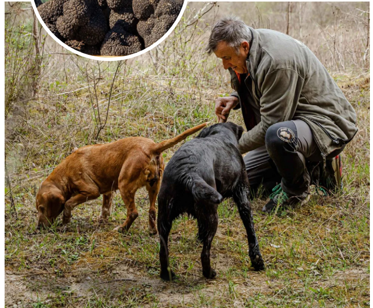
Truffle hunting in Motovun

Tour cost: $8,449 per person, ground only, based on double occupancy. $1,200 tax-deductible contribution to the ETV Endowment is included in the price of the tour.