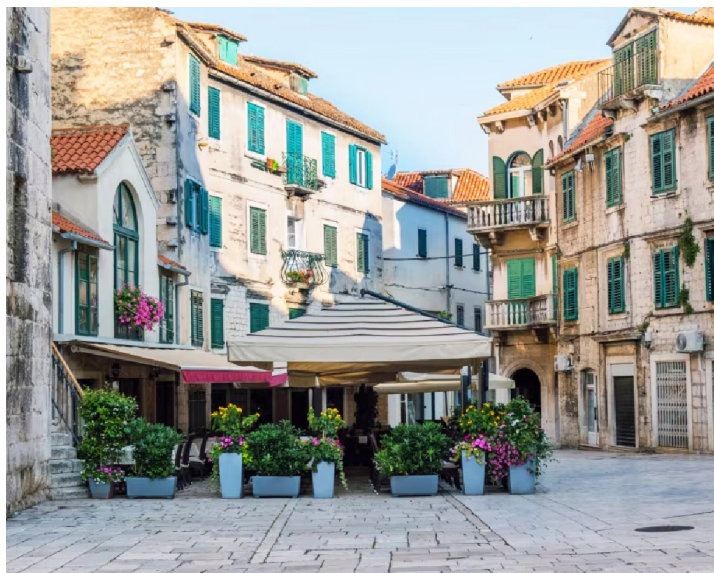
Old town Split