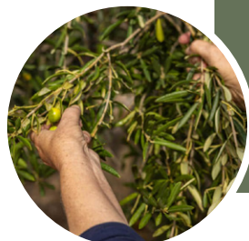
Croatian olive tree