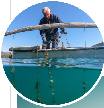
left: Oyster fisherman, Ston below: Our Lady of the Rocks

Arrival at Dubrovnik Ruđer Bošković Airport (DBV). Transfer by private motorcoach to Dubrovnik and check in to the 5-Star Excelsior Hotel perched above the Adriatic. Our introduction to the Baltics begins with an expertly curated walking tour through the limestone streets of Dubrovnik's Old City, the "Pearl of the Adriatic," where 16th-century walls guard a maritime republic that once rivaled Venice. We'll enjoy a Welcome Reception followed by an exclusive Welcome Dinner overlooking the city and the Adriatic.